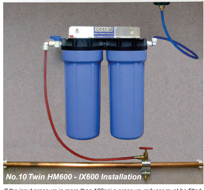
If the input pressure is more than 100psi a pressure reducer must be fitted.