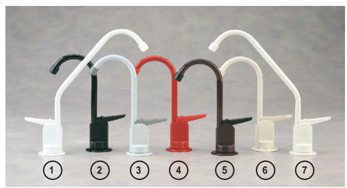
Coloured taps - 1 white, 2 black, 3 grey, 4 red, 5 brown, 6 almond, 7 bisque.

Whatever your decor, Pozzani offer a choice of tap to suit, chromium (standard), various metal and ceramic painted finishes